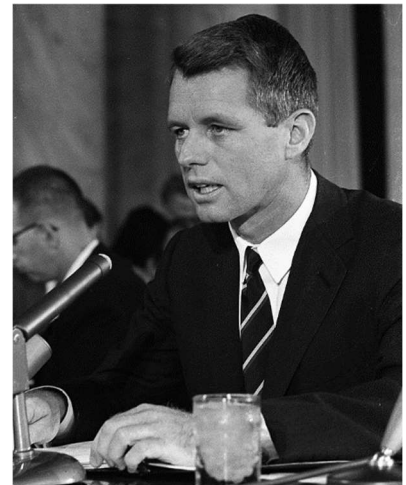
Robert Kennedy served as chief counsel for the Rackets Committee and then as U.S. attorney general. In both roles, he fought the Mob.

Since the Rackets Committee, a series of laws and groups have worked to dismantle organized crime. Traditional Mob groups are not as powerful, but organized crime still exists. The 21st century has ushered in a global network of criminals that could not have existed without modern technology. Criminals increasingly operate on a global scale. International law enforcement agencies have strengthened their collaborations to combat these new groups.