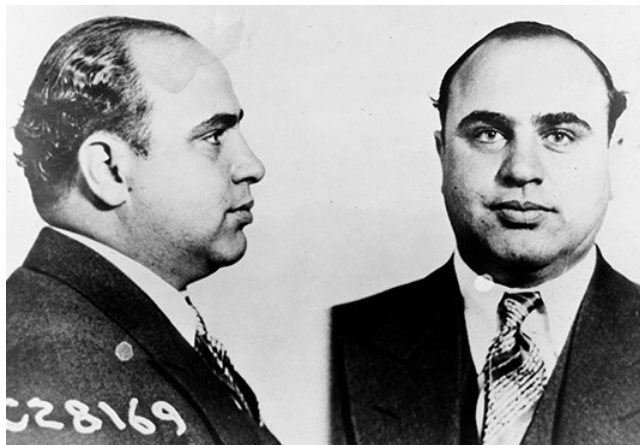
Al Capone was an incredibly successful bootlegger in Chicago. He ran the North Side Gang, which operated illegal bars known as speakeasies and smuggled alcohol into the United States from Canada.

Prohibition was the 18 th Amendment to the Constitution, which outlawed alcohol in the United States. Prohibition was in effect from 1920-1933. During Prohibition, Americans could not sell, make or transport alcohol, but that did not stop people from drinking it.